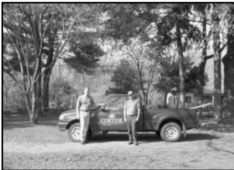
Cortese Tree Specialists gave Ramsey House a day of work on the grounds worth $1,600.

around 1813, are posted on their website. We are pleased that our Samplers are two of the oldest on the site. To view them go to www.tennesseesamplers.com .