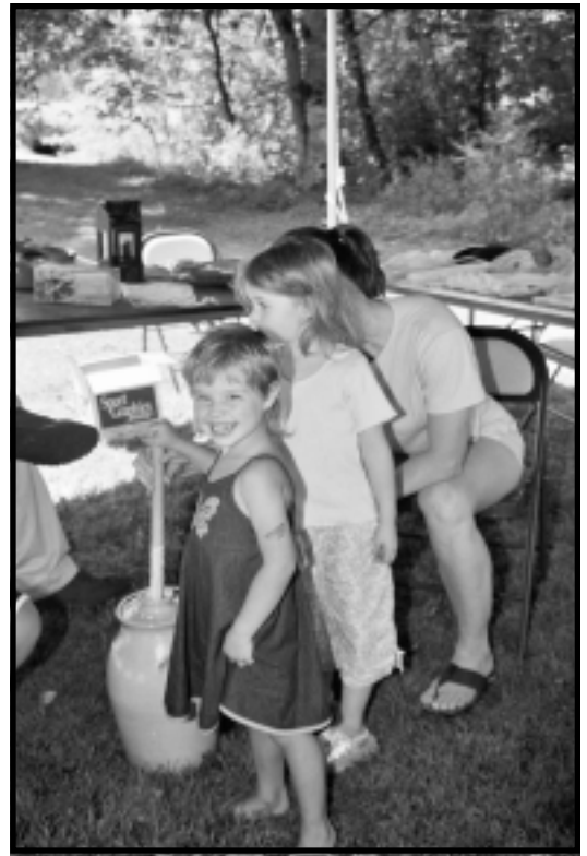
Churning Butter at Country Market.

Thanks to all of those who volunteered their time, money, and hearts to make Country Market another great event at Ramsey House!