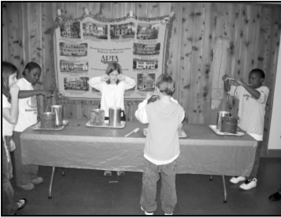
Students from Fountain City Elementary enjoying candle-dipping.